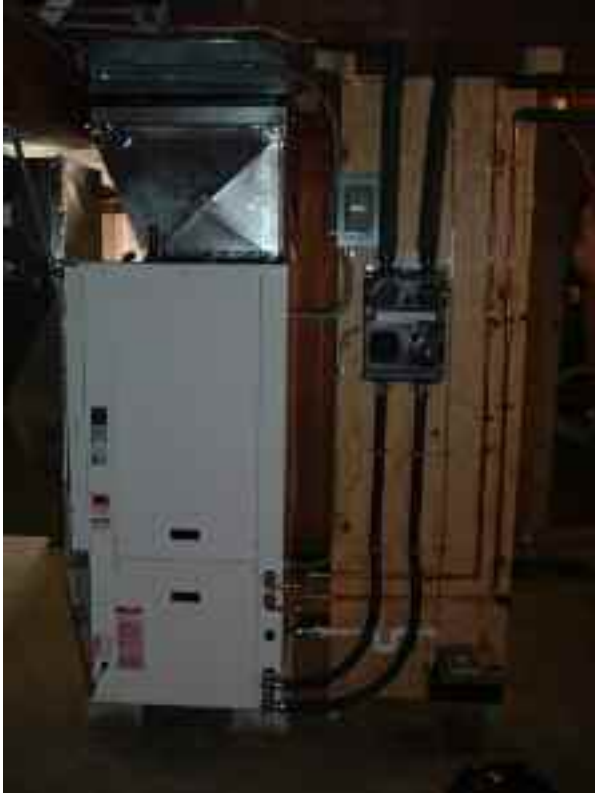
Aqua Comfort GT Series Heat Pump