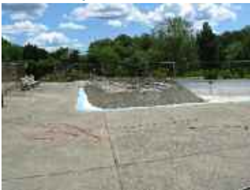
50 year old deck Before

Euclid Tammscoat allows for the complete renewal of your concrete pool deck without costly demolition and removal of the old deck. Call us today for a free estimate to renew your pool or patio today.