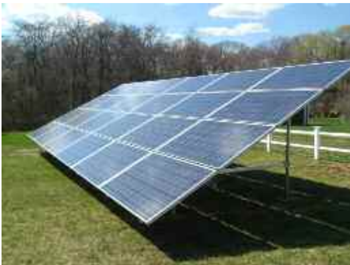
4.56 kW ground mounted solar array

When Ms. Collins wanted to go green, she meant it. She first contacted us to install a solar electric array at her home. Upon inspection we recommended a ground mounted solar array would best fit her needs. The 4.56 kW system would supplement at least 40% of current electric usage. With help from the Commonwealth Solar Program, an uncapped 30% federal tax credit, and a $1000 state tax credit, she would realize a payback of 9 years.